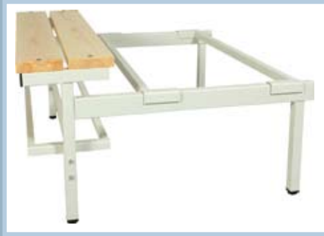
Bench with shoe rack.