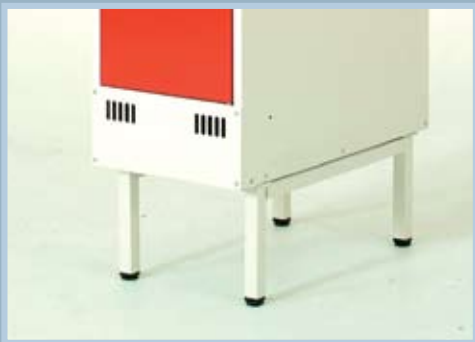
Locker with legs.

Wall mounted bench. For lockers without legs, the bench is attached to the locker's base. These lockers are attached to the wall by a plate on the back of the locker.