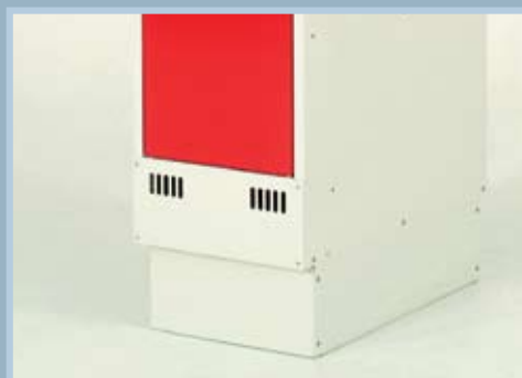
Locker with plinth.

Base with an attached bench are available for all locker combinations. The solid square legs carry both the locker and the bench. Height adjustment screws come as standard.